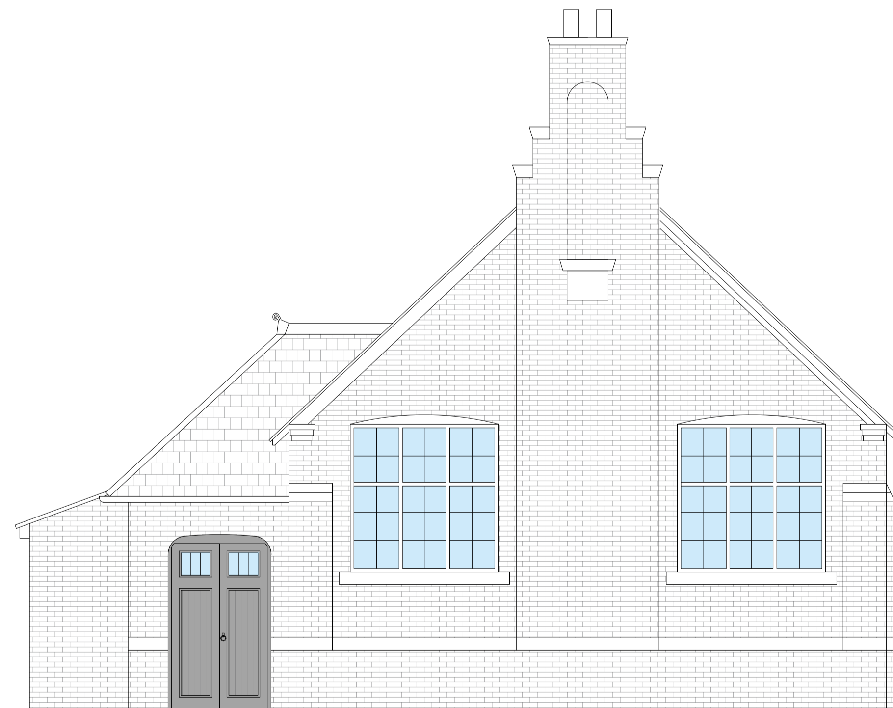
EXISTING SOUTHERN ELEVATION SCALE 1:50