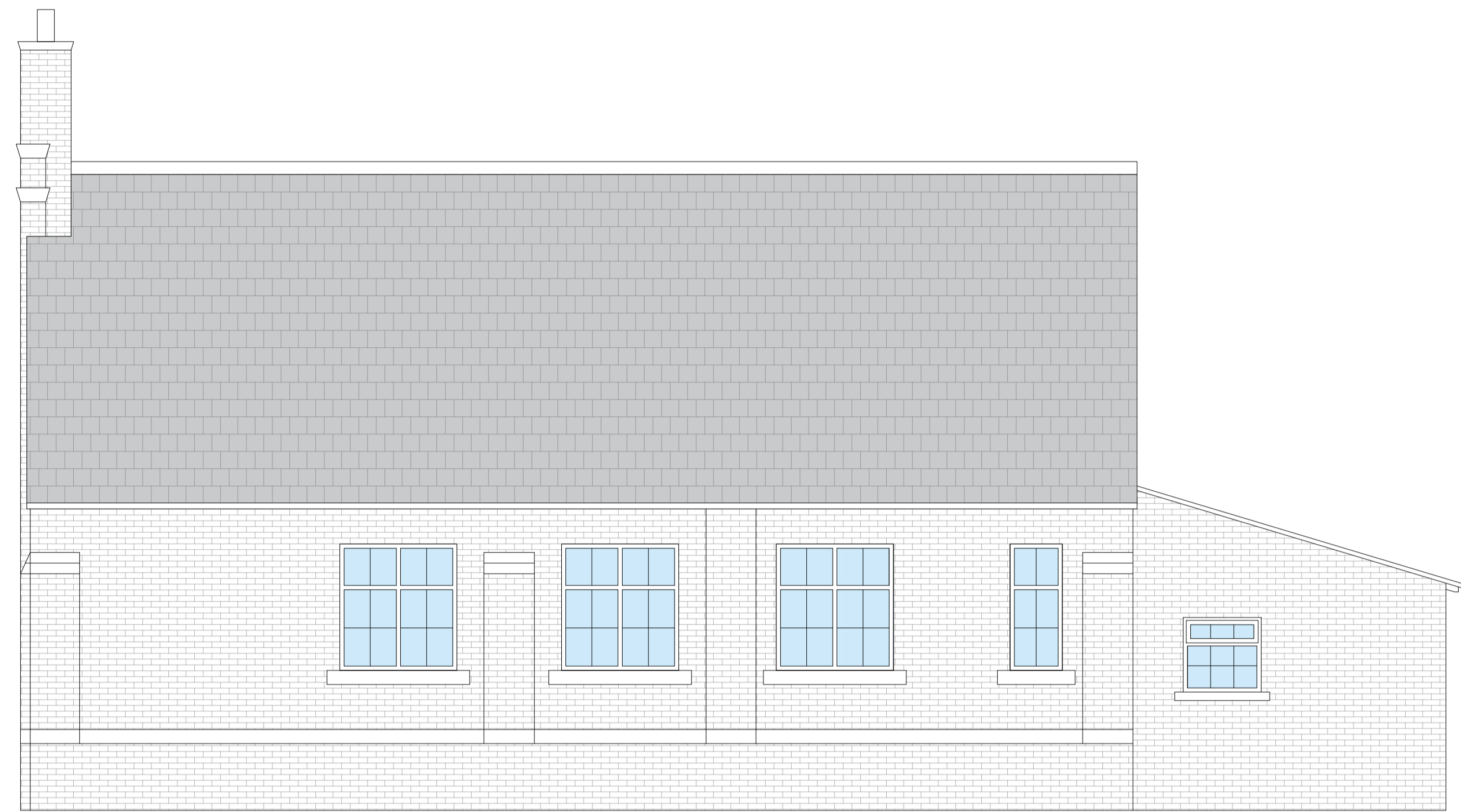
EXISTING EAST ELEVATION SCALE 1:50