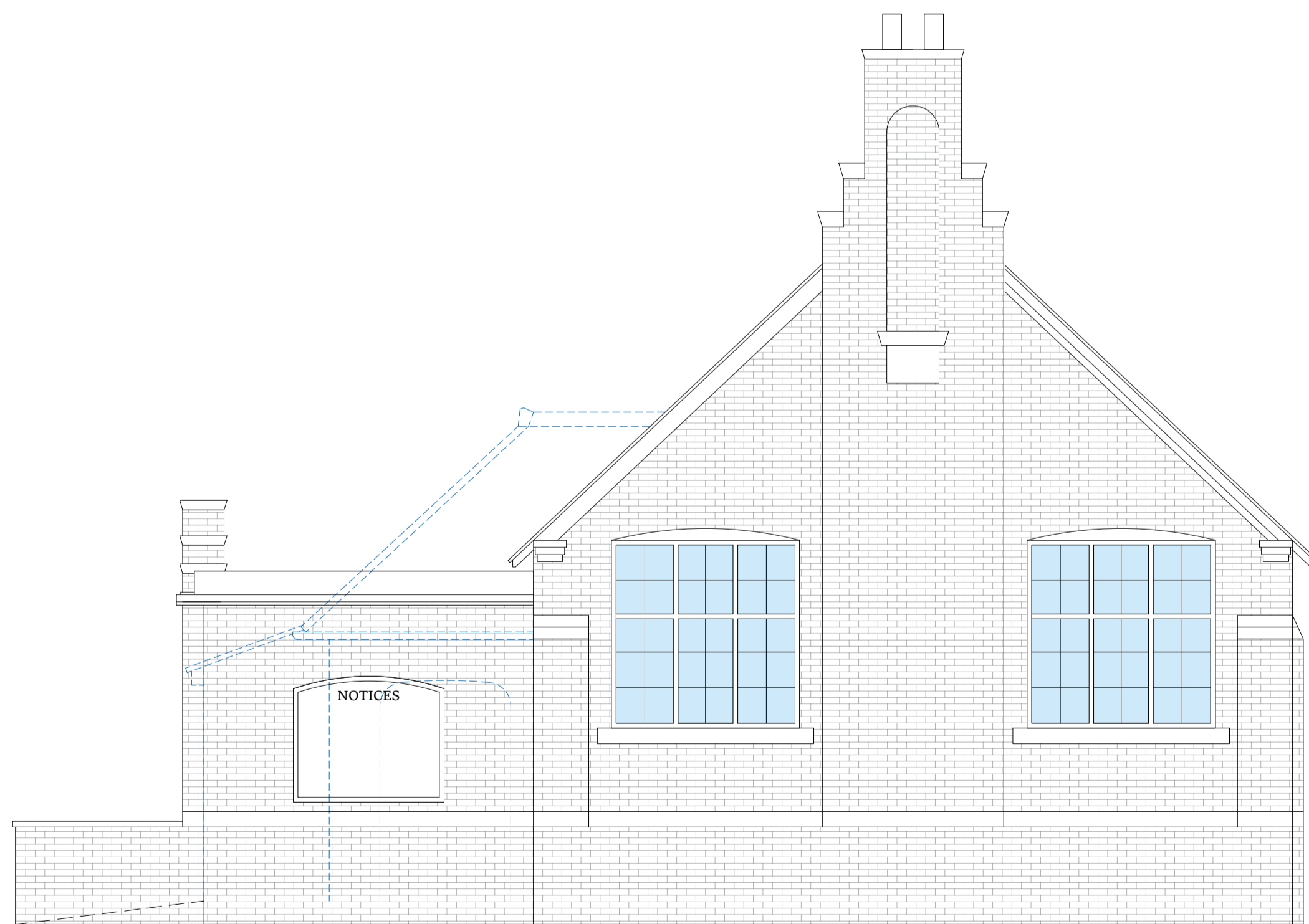
PROPOSED SOUTHERN ELEVATION SCALE 1:50